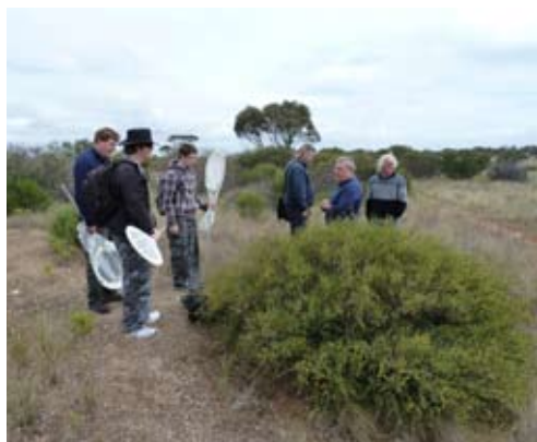
Photo record of the EXCURSION to Purnong on 24th September, 2011.