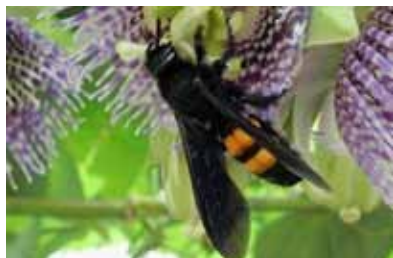
A wasp visits a passion-flower.

The study also elucidated the importance of non-bees to crops that are not attractive to bees such as custard apples, soursop and mangoes.