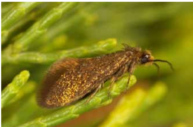
The newly discovered enigma moth is regarded as a 'living dinosaur'