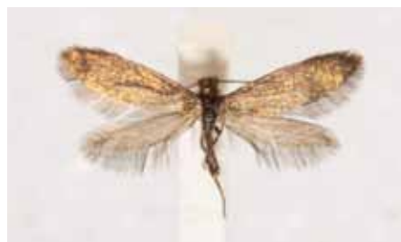
The enigma moth is the first new family of moths to be discovered in the world since the 1970's