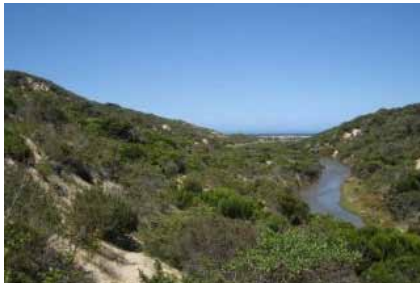
The enigma moth lives on Southern cypress pine trees near the mouth of the willson River on Kangaroo Island.

Enigma moths inhabit Southern Cypress pine trees and have an extremely short lifespan.