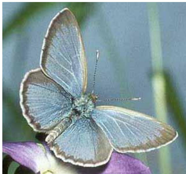
Photos: egg, mid larva, mature larva and adult upperside