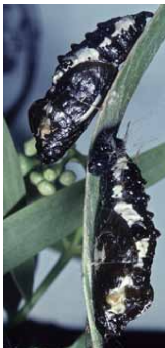
Photos: eggs, first instar larvae, final instar larvae, adult underside and pupae LFHunt.