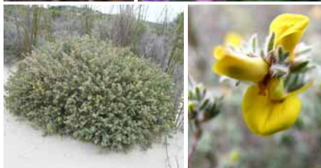
Host plant photos: Hardenbergia violacea (Native Lilac); Swainsona formosa (Sturt Desert Pea); Lotus australis (Austral Trefoil); Cullen australasicum (Psoralea or Tall Scurf Pea); Pultenaea tenuifolia bush and flower (Narrow-leaf Bush-pea).