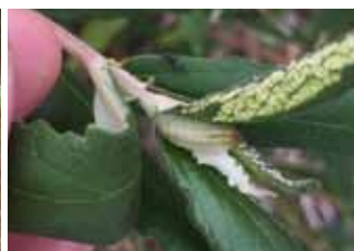
Group; flowers on the dune; six month old Bitterbush, Adriana quadripartita ; Bitter bush blue butterfly larvae and attendant ants on the Adriana quadripartita earlier this year and below rising ground revegetation site.