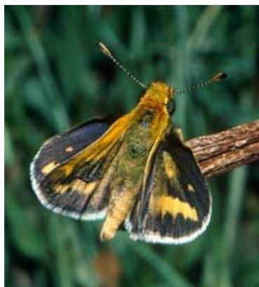
Some of Lindsay's photos: Nacaduba biocellata (Double-spotted Line-blue); Grassland Copper; Polyura sempronius (Tailed Emperor) and Taractropera papyria (White-banded Grass-dart).