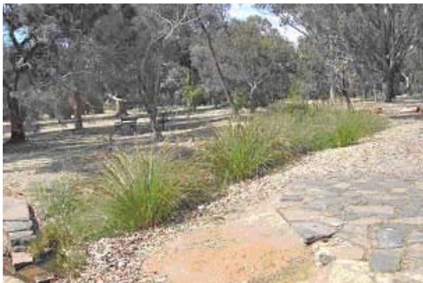
Above: Gahnia plantings at Waite Arboretum December 2006 Right: Gahnia sieberiana plantings at Mt. Bold Reservoir Aug 2006.

On 31 August 2006 our Gahnia sieberiana plantings at the Mt Bold Reserve were examined (after the driest winter on record – a quarter of the normal rainfall). The condition of the plantings was highly variable, with 180 live Gahnia counted from the original planting of 400 (August 2003). About 25% of the 180 were in good condition with growth of about 1m, another 25% were in good condition but lightly grazed, while the remaining were severely over-grazed by the resident kangaroos, deer and also rabbits now making a comeback. These plantings were well inhabited by Hesperilla donnysa . We have not been back to check if the plantings escaped the fires of 10-11 January 2007, as we are no longer allowed into the reserve due to security concerns.