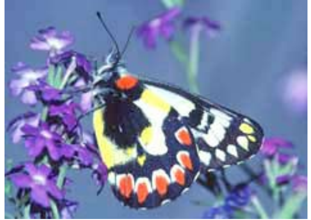
Our emblem the Wood White Delias aganippe

The early butterfly conservation issues were to find out what butterflies were in decline, to move from anecdotal to data based evidence of habitat and numbers, and define their protection needs. Education for bushcare workers on how to provide specific butterfly habitat requirements was high on the agenda. Initial projects to survey, replace and secure habitats, and nominate species for protection under the Endangered Species Protection Act were undertaken. Educational materials