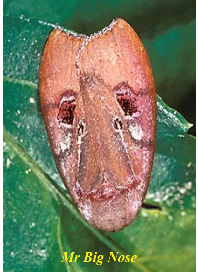
Mr Big Nose