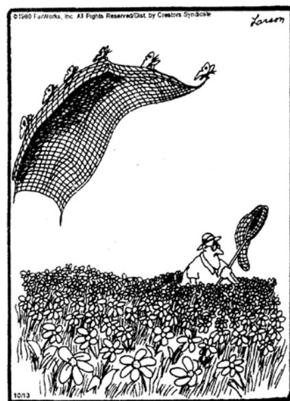
The Far Side © by Gary Larson